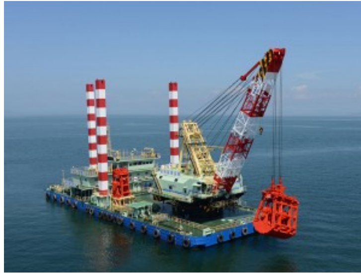
Wakawashi Maru: Grab dredger and all swivel hoist