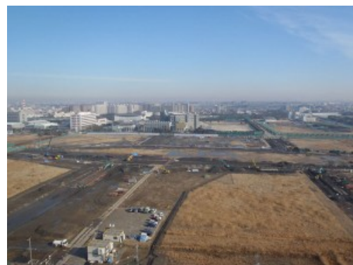
Sewerage and construction work