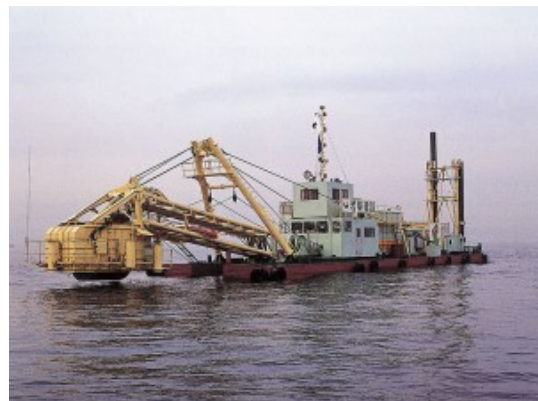
Clean sweeper No.2