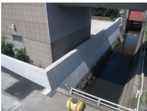
Climax policy chest wall fortification