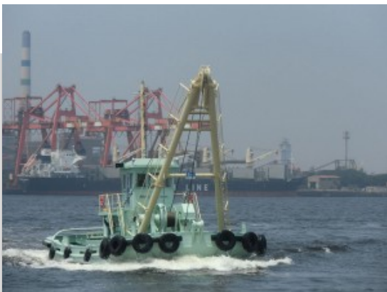
No.20 Otori Maru