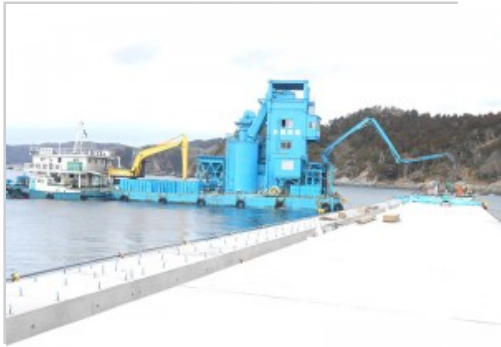
"Concrete mixer ship" concrete placement work