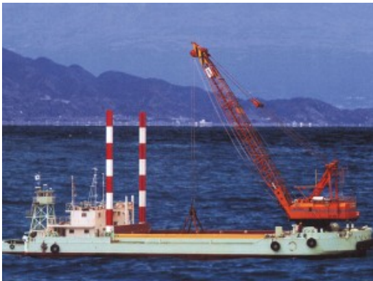
Ryuo: Multipurpose hoist ship with spud