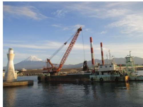
"Ryuo" grab dredging construction