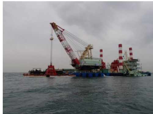
"Wakawashi Maru" grab dredging construction