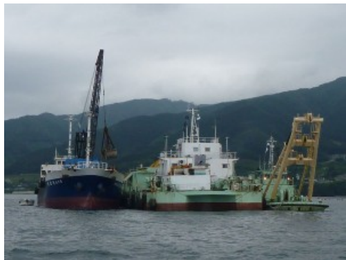
"WTS-1000" Spreadig sand construction