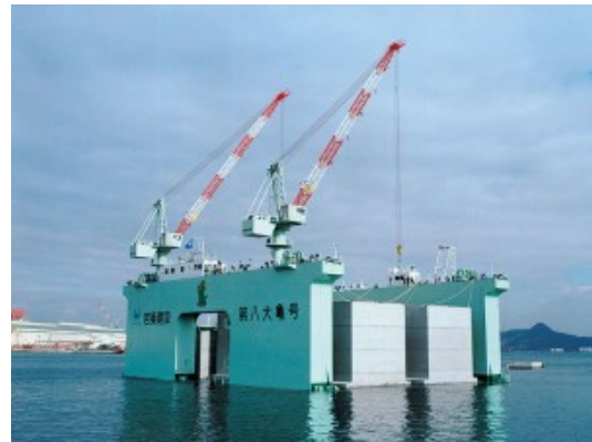
No.8 Taiki go: Caisson work platform